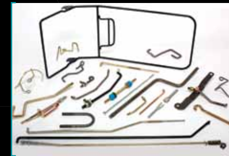
Wire & Tube Formed Products