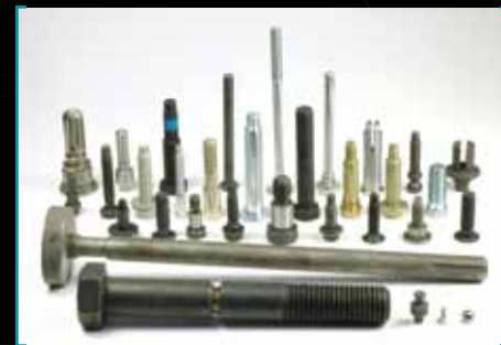
Engineered Cold Formed Components