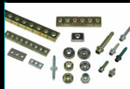
Pierce & Clinch Fasteners