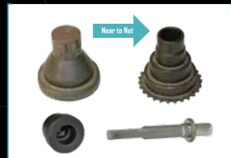
Near Net Forms