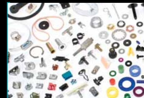
Class C Items