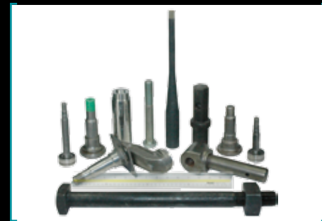
Large High Strength Cold Forgings