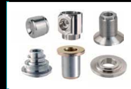
CNC Precision Machined Components