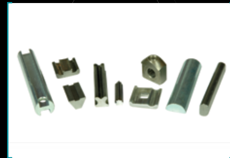
Roll Formed Components