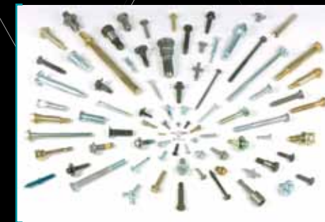
Standard & Semi-Standard Fasteners